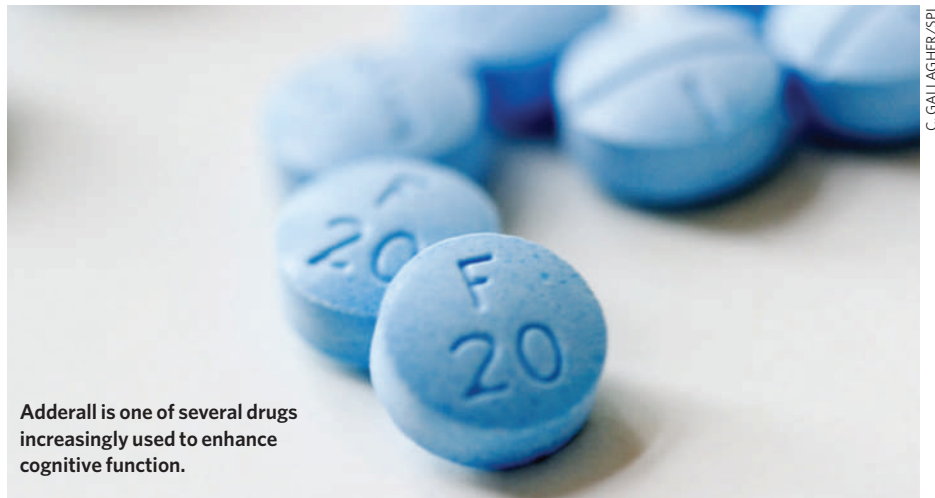
Adderall is one of several drugs increasingly used to enhance cognitive function.

Many of the medications used to treat psychiatric and neurological conditions also improve the performance of the healthy. The drugs most commonly used for cognitive enhancement at present are stimulants, namely Ritalin (methylphenidate) and Adderall (mixed amphetamine salts), and are prescribed mainly for the treatment of attention deficit hyperactivity disorder (ADHD). Because of their effects on the catecholamine system, these drugs increase executive functions in patients and most healthy normal people, improving their abilities to focus their attention, manipulate information in working memory and flexibly control their responses 3 . These drugs are widely used therapeutically. With rates of ADHD in the range of 4–7% among US college students using DSM criteria 4 , and stimulant medication the standard therapy, there are plenty of these drugs on